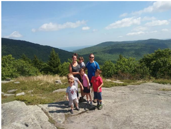
Piper Mountain – Belknap Mountain Range