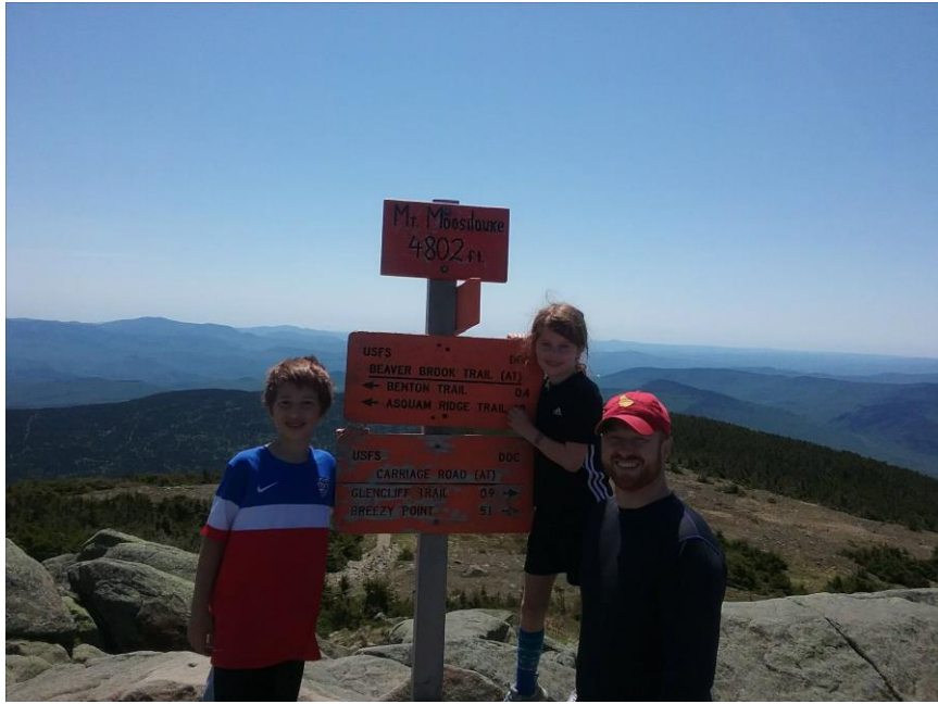
Mt. Moosilauke – 2 Days 13 Miles