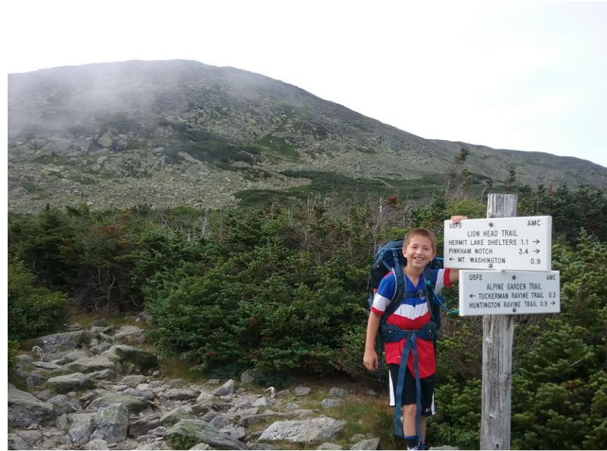
Mt. Washington – 3 Days 20 Miles