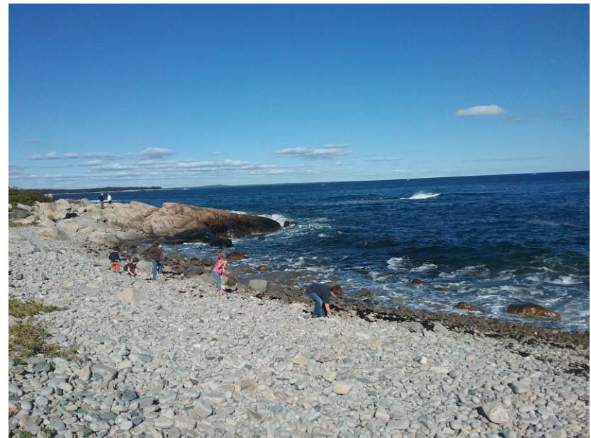
Acadia – Schoodic Peninsula