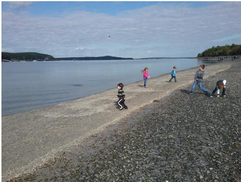
Acadia – Bar Harbor